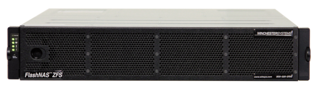
FlashNAS ZFS ZX-2U12 is perfect for primary filer and for remote backup targets. Expandable to 120 disks with nine 2U expansion shelves 960 TB with 8 TB disks.

The revolutionary ZFS file system adds end-to-end error detection and correction,