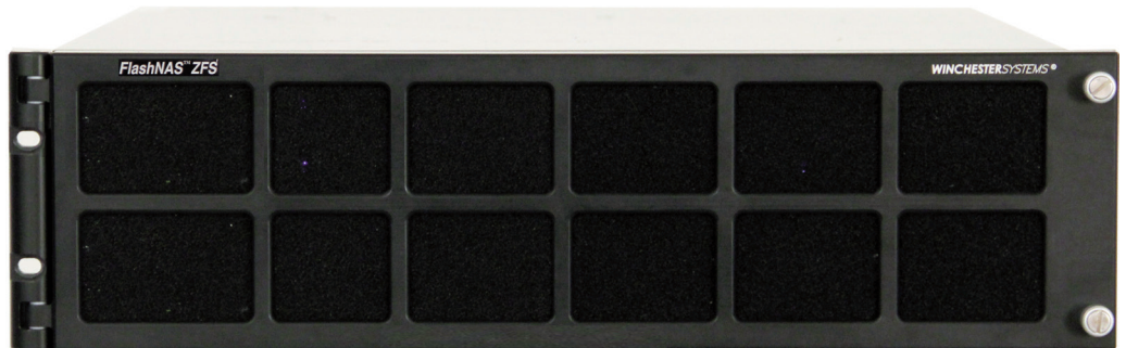
FlashNAS ZFS RZ-3U16. Expandable to 240 disks with fourteen 3U expansion shelves.

FlashDisk RZ-3U16 is a rugged version of the commercial ZX-3U16 with the same performance levels and Fibre Channel and iSCSI host support. However, these “COTS Rugged” ZFS storage systems are designed to store and protect data in harsh operating environments: tolerating levels of dust, moisture, shock and vibration not possible with standard commercial units - at far less expense than fully rugged systems. It supports 16 SAS disks (HDDs or SSDs) per shelf and provides up to 128 TB of storage in the base unit, expandable to 1,920 TB. The front door is crafted of 3/4-inch milled aluminum to provide rigidity, structural integrity and prevent flying-object hazards. It also contains a heavy-duty filter to trap dust particles and provide a moisture shield to protect internal components. The door also features a dust and raindrop seal. An optional 1U mounting tray is available that permits front access for normally rear services, saves three feet behind the unit and increases structural integrity.