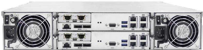
FlashNAS ZFS RZ-2U12 rear view, showing 8 iSCSI 1GbE and 4 iSCSI 10GbE ports.