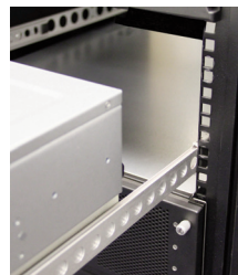
Rugged unit on mounting tray with aluminum ball-bearing rails fully extended for rear access.

Expandable Storage Pools: Created from multiple RAID sets and easily expanded.