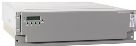
RF-2U12 mounts flush to submarine bulkhead.