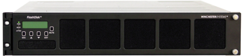
FlashDisk RF-2U12, shown in anodized black, offers 96 TB with 12 disks to 8 TB each - ideal for mobile applications - providing field reliability and data protection at COTS prices.