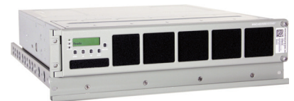
FlashDisk RF-2U12 with 1U mounting tray shown in US Navy Gray.