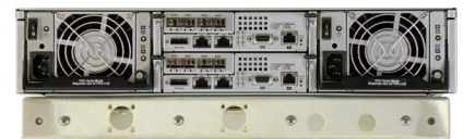
FlashDisk RF-2U12 rear view with 1U mounting tray.