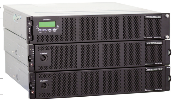
FlashDisk HX - Front View - Shown with 2U, 24-drive expansion shelves.