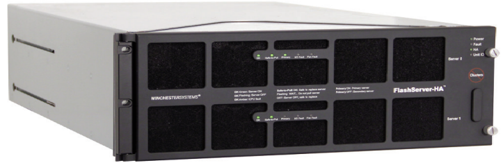
FlashServer HA provides High Availability without clusters and reduces the complexity of your IT environment

FlashServer HA Redundant Failover Servers provide an innovative hardware solution to address planned and unplanned downtime for your most important applications. FlashServer HA delivers continuous uptime through its fully redundant modular hardware featuring Intel Xeon E5 processors with up to ten cores each. These servers provide continuous availability through hardware redundancy in all components: CPU, memory, motherboards, I/O, hard disk drives, power supplies and cooling fans. Two servers in one unit run applications simultaneously; if one fails, the other takes over immediately with no lost data and no delays common to cluster solutions . Best of all, only one set of software licenses is needed, delivering big savings compared to cluster software solutions.