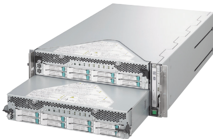
Hot swap servers are quickly and easily replaced - and enable live software updates.